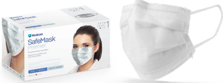
SafeMask® Premier (Family)