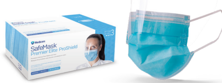
SafeMask® Premier Elite ProShield