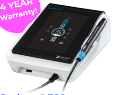
Cavitron® 300 #8161429