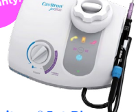
Cavitron® Jet Plus #8161428