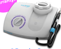
Cavitron® Prophy-Jet #8161427