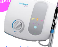
Cavitron® Plus #8161425