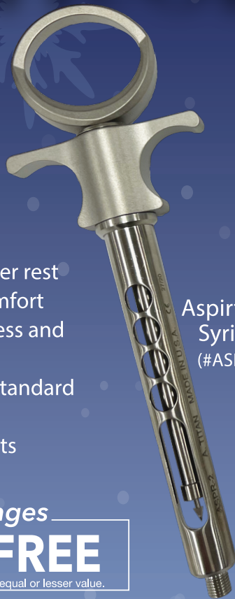
Aspirating Syringe (#ASPR-1)

*Free good(s) must be of equal or lesser value.