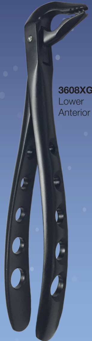
3608XG Lower Anterior