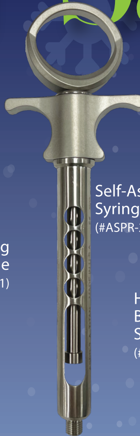
Self-Aspirating Syringe (#ASPR-2)