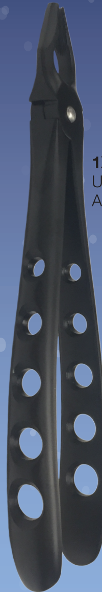
1XG Upper Anterior