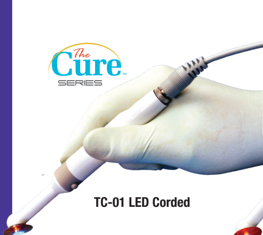
TC-01 LED Corded