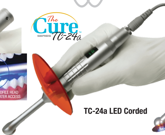
TC-24a LED Corded