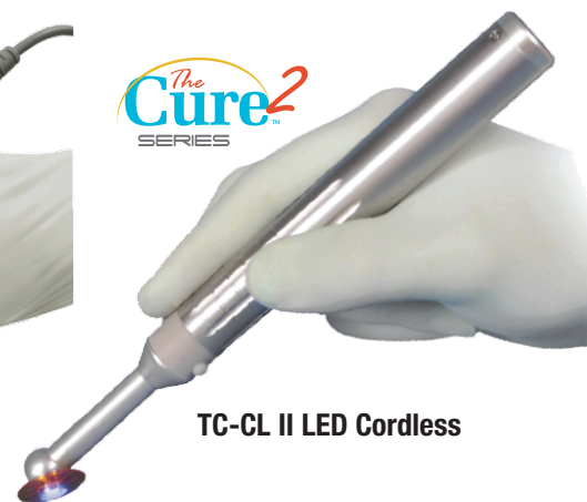
TC-CL II LED Cordless