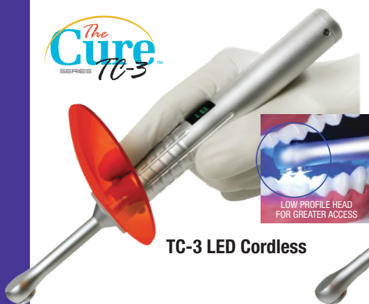
TC-3 LED Cordless